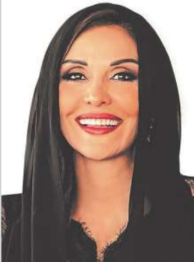
DIANA HAMADE ATTORNEYS AT LAW IN ASSOCIATION WITH EKP

Family law heads news in the times of the Coronavirus, from visitation and alimony, to travel bans; from domestic violence to marriages online. The current climate also shows an increase in families seeking advice on succession planning and wills amidst these uncertain times.